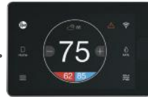
EcoNet Smart Thermostat