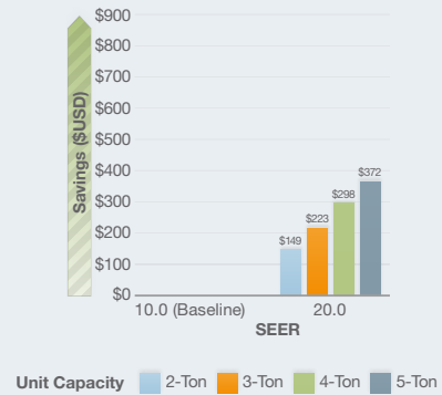
Annual Energy Cost Savings for Cooling 10.0-SEER Baseline*

*Most commonly replaced system. Energy savings shown are calculated per AHRI (Air Conditioning, Heating, and Refrigeration Institute) annual operating costs and represent directional numbers most applicable to typical cooling and heating requirements within the mid-latitudes of the U.S.