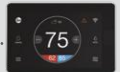
EcoNet Smart Thermostat